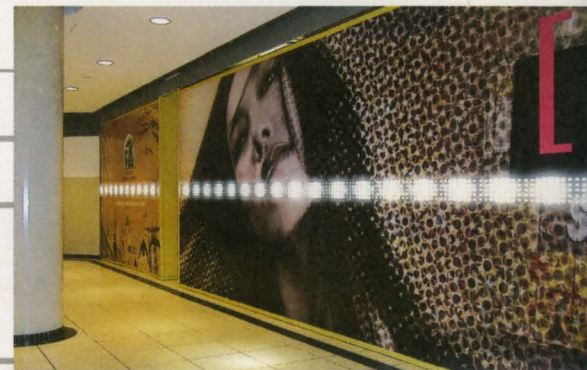
Erwin Redl, SPEED SHIFT