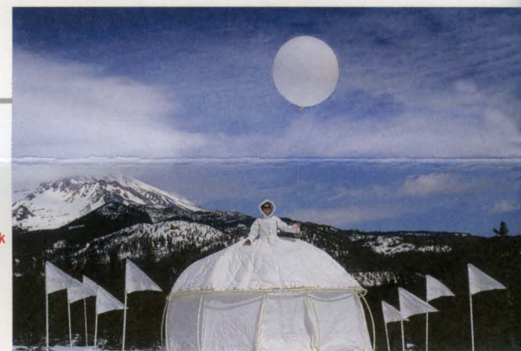
Robin Lasser/Adrienne Pao/Cara Spooner, Ice Queen: Glacial Retreat Dress Tent , 2008, 40 x 48 inch color photograph